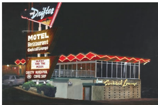
The Drifter , oil on canvas 48"x72"

Neumann’s luminous oils and watercolors penetrate the duality of the American experience; the thrill of adventure, the romance of the road and the loneliness and melancholy echoed by vapid advertisements on rusting signs. They invite us to step into a world where the common-