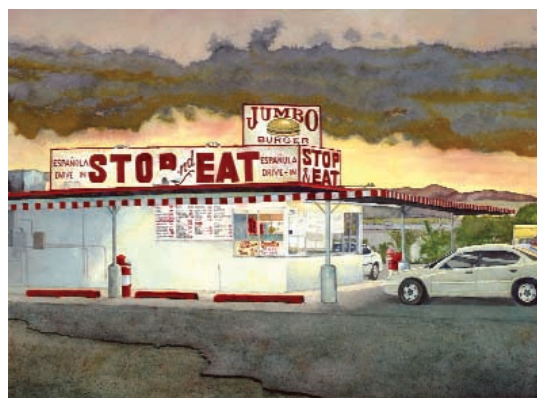
Stop & Eat , watercolor 30"x40"